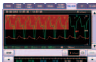
Full disclosure Up to 72 hours of 5 waveforms *transport mode: 24 hours