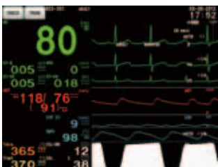
All parameters includes waveforms

The large 5.7-inch screen clearly displays all parameters. MULTI connectors allow flexible parameters and optimal monitoring based on the patient condition. Life Scope PT can also show comprehensive review data including full disclosure that are typically found only in a central monitor.