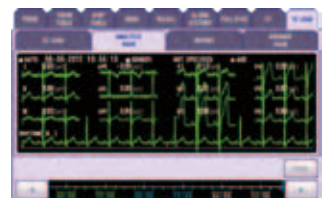
12-lead ECG analysis Includes ECAPS 12 C, the same advanced 12-lead ECG analysis software in Nihon Kohden electrocardiographs.