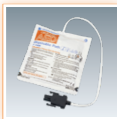
• Defibrillation Pads (P-740K)

This brochure may be revised or replaced by Nihon Kohden at any time without notice.