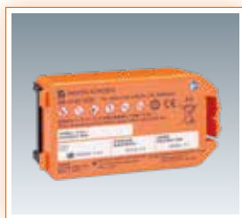
• Battery Pack (SB-310V)