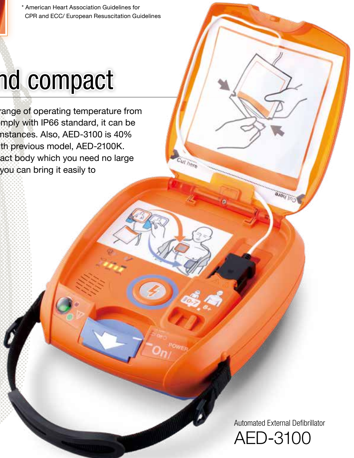
Automated External Defibrillator AED-3100

AED-3100 has wide range of operating temperature from -5^{\circ}\text{C} to 50^{\circ}\text{C} . As it comply with IP66 standard, it can be used in severe circumstances. Also, AED-3100 is 40% smaller compared with previous model, AED-2100K. AED-3100 has compact body which you need no large space to install, and you can bring it easily to emergency site.